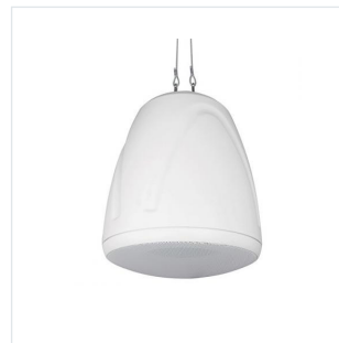
SPS80TW 80W 8ohm / 32W 100v Suspended pendant speaker