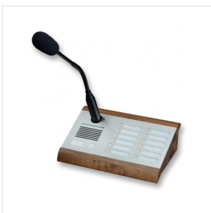
Axis - SIP MIC IP zone paging microphone