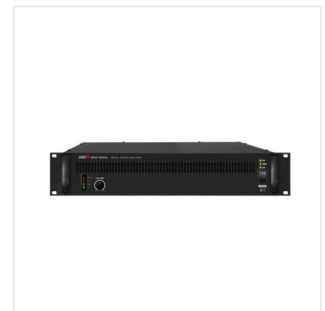
Inter-M DPA900S 1x900w 100v power amplifier