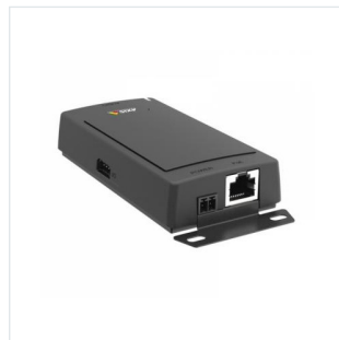
Axis - C8033 Analog-to-Network audio bridge