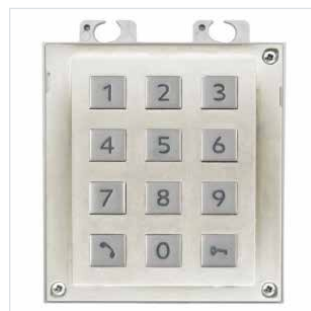
2N IP Verso Door Intercom - Keypad Module