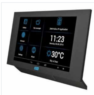
2N Indoor Touch Touchscreen Digital Intercom