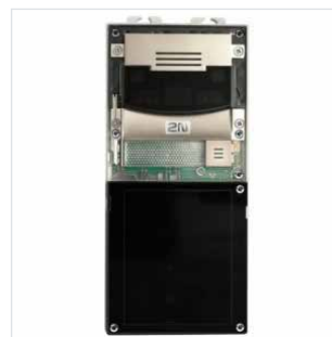
2N IP Verso Modular Door Intercom Basic Unit with Camera