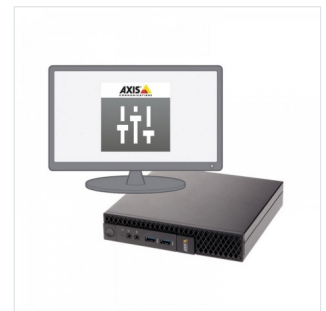
AXIS - Audio Manager Server