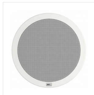
AXIS - C2005W Network Ceiling Speaker