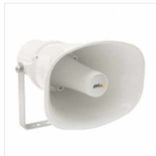
AXIS - All-in-one Network Audio Horn Speaker - white