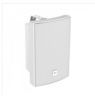
AXIS C1004-EW Network Cabinet Speaker - White