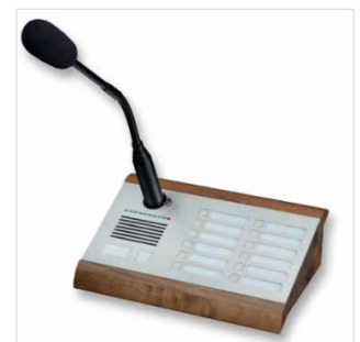
2N NetMic IP Zone Paging Microphone