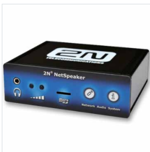
2N Net Audio Decoder - Audio over IP Endpoint