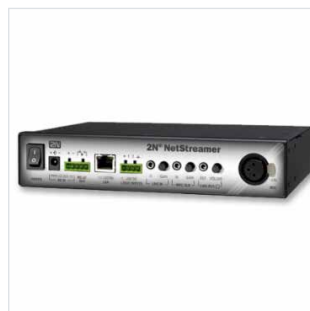
2N Net Audio Encoder - Analogue audio to IP signal converter