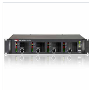
InterM DPA300Q 4x 300W 100v Power Amplifier