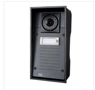
2N - 9151101CW IP Force Intercom - 1 call button, camera, 10W speaker