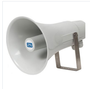
2N - 914422E SIP Speaker, Horn Audio-over-IP Loudspeaker - White