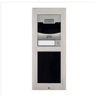
2N - 9155101C IP Verso Intercom - Modular Door Intercom Basic Unit with camera