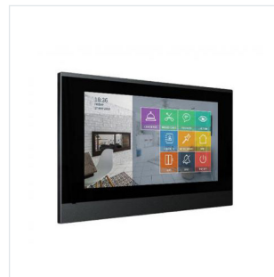
Akuvox - X7HD 7" Indoor Touchscreen Intercom Panel, Black