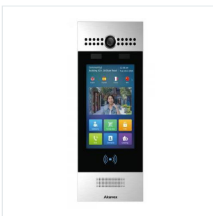
Akuvox - R29S SIP Touchscreen Intercom with Camera, RFID Card Reader