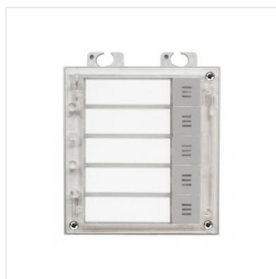
2N - IP Verso door intercom 5 button module