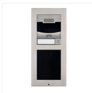
2N - IP Verso Modular door intercom with camera