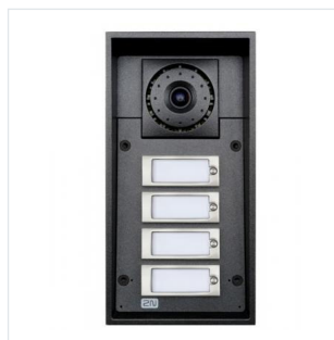
2N 9151104CHW IP Force with 4 call buttons