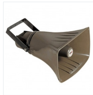
Inter-M - HS-30RT 30W Horn Loudspeaker, IP65 Rated