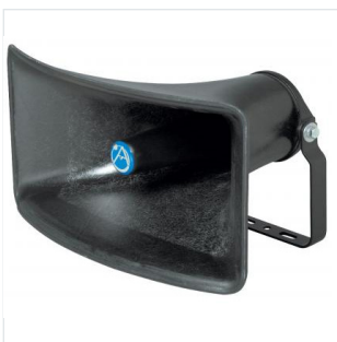
Atlas IED - CJ46 Horn Speaker