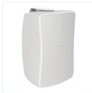
Inter-M - WS30T-WK 30W Full Range Speaker