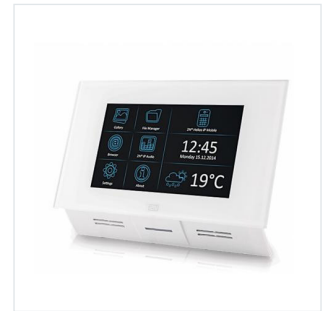
2N - 91378365WH Indoor Touch - Touchscreen Digital Intercom, PoE, White