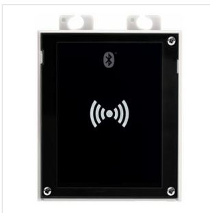
2N - 9160335 IP Access Unit 2.0 - Access Control Module with Bluetooth & RFID