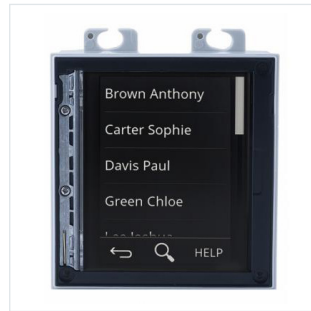
2N - 9155036 IP Verso Intercom - Digital Phone Book and Keypad Module