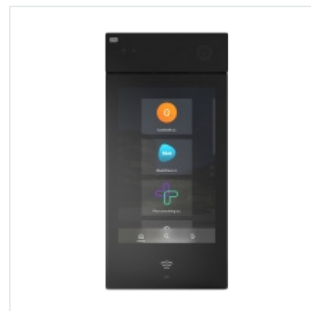
2N - 9157101 IP Style - Digital Touchscreen Door Intercom with Bluetooth and RFID, PCard Compatible