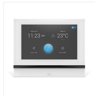
2N - 91378601WH 2N Indoor View - 7" Touchscreen Digital Answering Unit, White