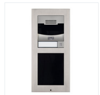
2N - 9155101C IP Verso Door Intercom - Modular Door Intercom Basic Unit with camera